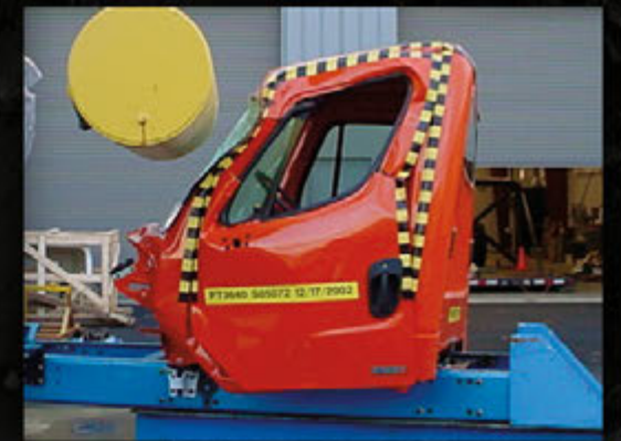
Components, systems and entire vehicles are subjected to an array of virtual and physical tests to ensure our trucks deliver the expected function, performance and reliability.