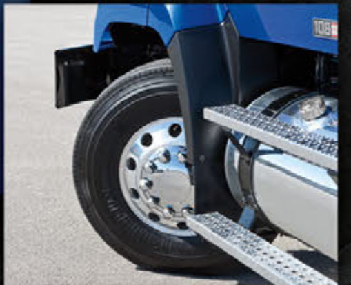
Superior wheel cut for outstanding maneuverability.