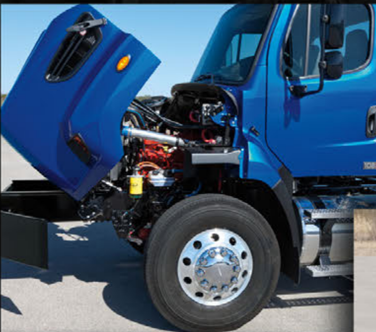
Tilt hood with radiator-mounted stationary grille for easy engine access.