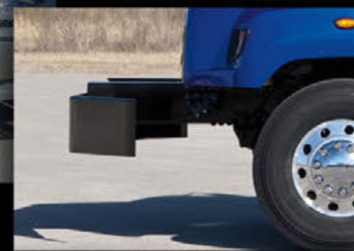
6" and 24" front frame extensions available.

• Cummins ISC engine standard, optional ISB engine