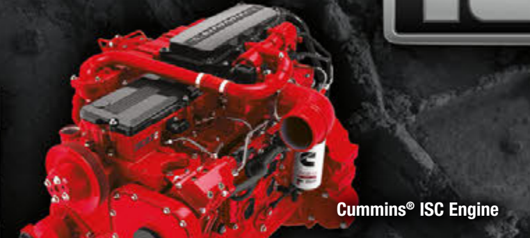
Cummins® ISC Engine