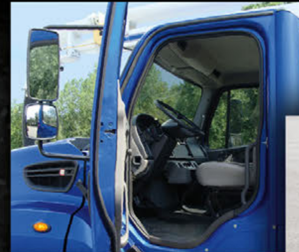
65-degree door opening for easy entry and exit.

• Cylindrical or rectangular fuel tanks available