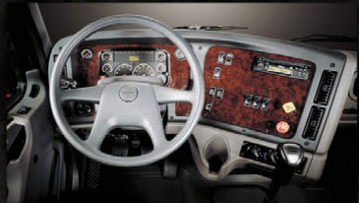
108SD standard wing dash.