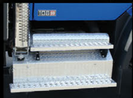
Exhaust aftertreatment located under cab for easy body upfit.

• A wide range of rear suspensions with optimized ratings