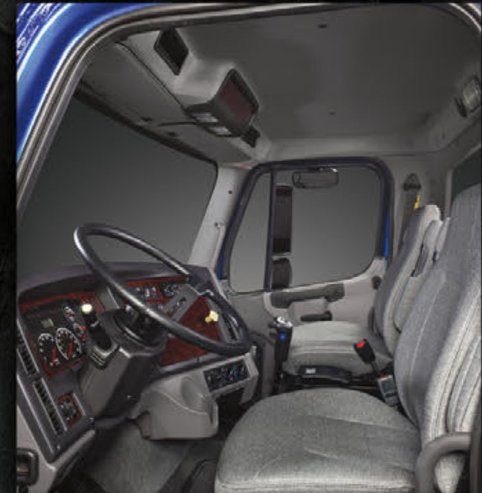
Ergonomically-designed driver's area features an automotive-style dash, easy-to-read LED-backlit gauges and controls within easy reach.